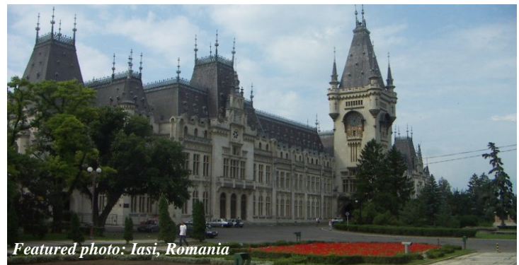
Featured photo: Iasi, Romania

Select Briefing is produced by the New European Democracies Project at the Center for Strategic and International Studies (CSIS), a private, tax-exempt institution focusing on international public policy issues. Its research is nonpartisan and nonproprietary. CSIS does not take specific policy positions.